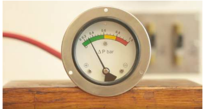
Color Band: Customizable 3 Color Arc