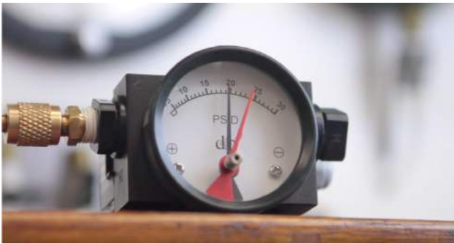
Follower Pointer: Shows Max Reading